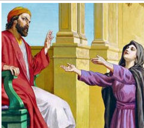
THE WIDOW & THE JUDGE

Serving: Ashmont, Collingullie, Glenfield, Lloyd, and San Isidore