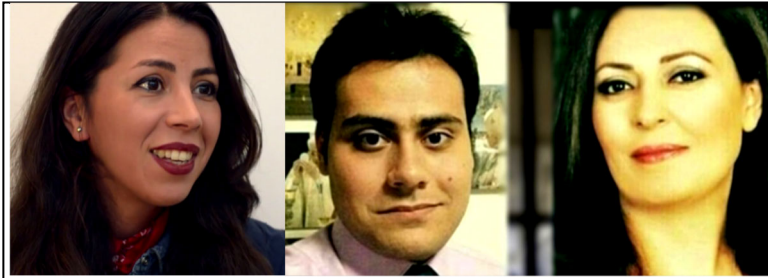
Some Iranian converts.