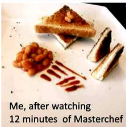
Me, after watching 12 minutes of Masterchef

Six year old Lisa and her four year old brother Tim were sitting together with their parents in the church when Tim started giggling and talking out loud. "You're not supposed to talk loud in church!" "Why? Who's going to stop me?" Tim asked. Angie pointed to the back of the church and said, "See those two men standing by the door? They're hushers."