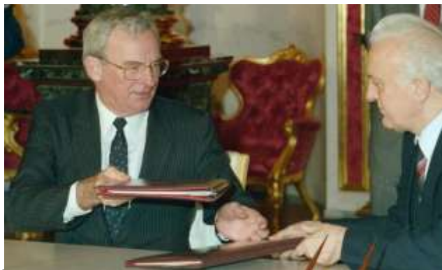
Bill Hayden (left) in 1987, signing an agreement with Soviet Foreign Minister Eduard Shevardnadze.

But twenty years later, Hayden felt a tug on his heart.